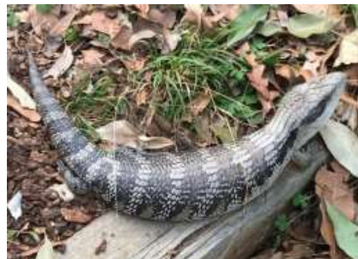
Pregnant Blue Tongue Lizard