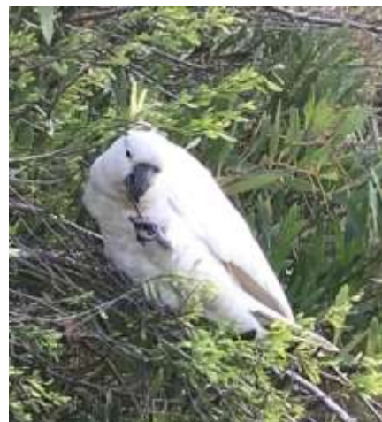
Cockatoo feeding on a wattle

I've included some photos of the many 'hidden treasures' in the Foord Avenue site, such as the native Rough Maidenhair ferns, fungal growths and smaller flowering grevillea.