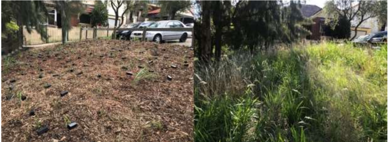
Top of Duntroon St steps March 2020 and March 2021