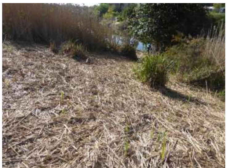
Area near the footbridge to be planted with grasses, early 2021