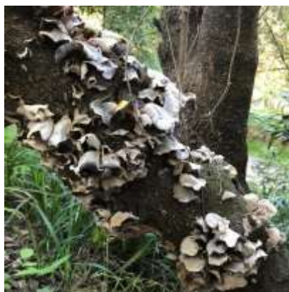
Fungus on pittosporum tree

This year has seen quite a bit of rain, which has really helped to get the new planting established, as well as filling out the broader site after our losses during the drought. As I write, the daisy bushes are a mass of sparkling flowers, wattles are just coming into flower, and hakeas and grevilleas are also flowering, attracting native bees and blue wrens. Olive backed orioles are now well established all year round; large flocks of cockatoos and corellas feed on wattle seeds, and yellow tailed black cockatoos on the hakea seeds. We've also had occasional sightings of king parrots, golden whistlers and Eastern rosellas. Many thanks to all our volunteers who have contributed hours of their time to keep the weeds under control, as well as planting out new areas for all to enjoy. With the hugely increased foot traffic along the river as a result of COVID restrictions on other activities, it's been great to hear the many compliments from passers-by, and to gather some new recruits.