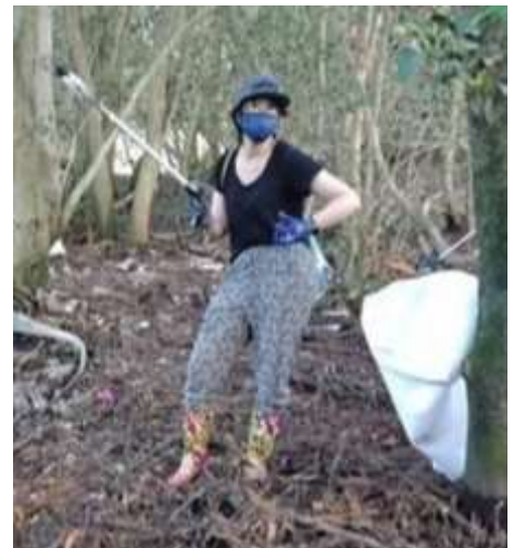
Mangroves clean up