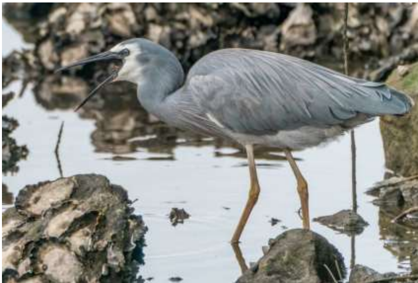
White faced heron July 2021

The sharing of knowledge and comradery among participants has made these surveys very informative and enjoyable. Thank you to all those who attended the Mudlarks surveys over the past 12 months.