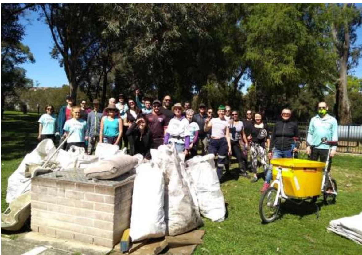
Close St Clean Up