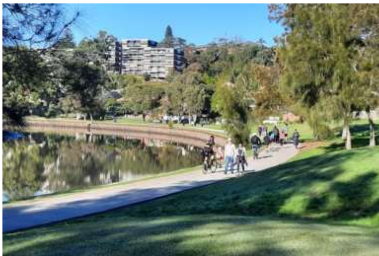
Large numbers flocked to the river as a refuge during lockdown