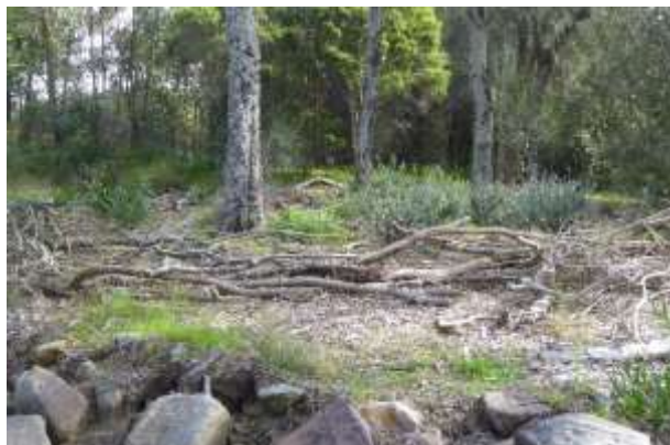
The third furthest upstream "island"