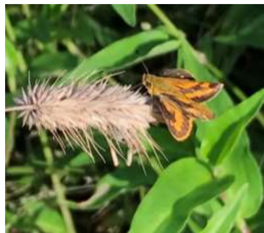
Grass Dart (Ocybadistes Walkeri?) resting on Hedgehog Grass (Echinopogon)