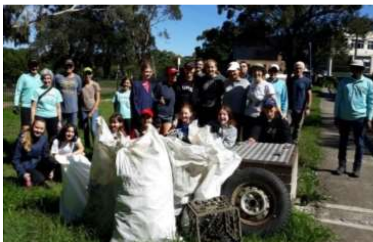
Close St Clean Up