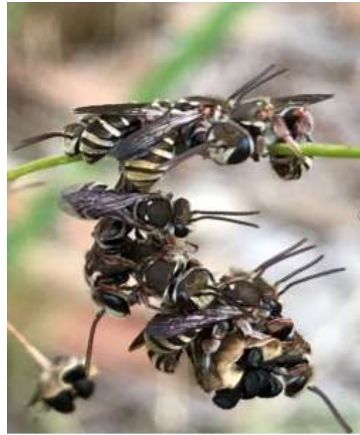
Lipotriches Bees roosting on Vanilla Lily (Arthropodium milleflorum)

The major project for the year was expanding the site East along Burnett St to create a rainforest pocket courtesy of a Community Environment Program grant – see separate grant report for more details. Thanks also to Canterbury Bankstown Council for ongoing advice and support.