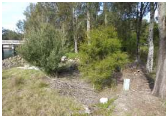
The first of the 'islands' most downstream

The Mudcrabs meet on the first Saturday of the month to remove weeds, mulch and plant trees, shrubs and grasses which are thought to have originally existed in the area. Over the past 12 months we concentrated on the “islands” closest to the river, which are dominated by tall, mature casuarinas. The environment on these “islands” is very harsh. The trees suck the moisture out of the soil, and the salty winds which sweep across them, seriously impact the growing conditions.