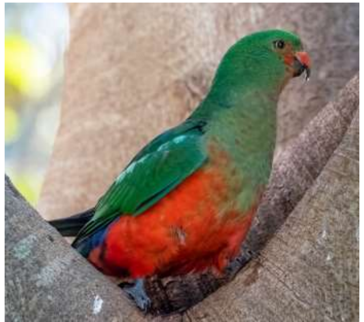
King parrot at Gough Whitlam park, courtesy David Noble