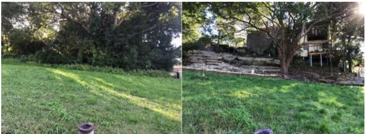
New Community Environment Program funded Rainforest pocket before and after July 2020 and June 2021