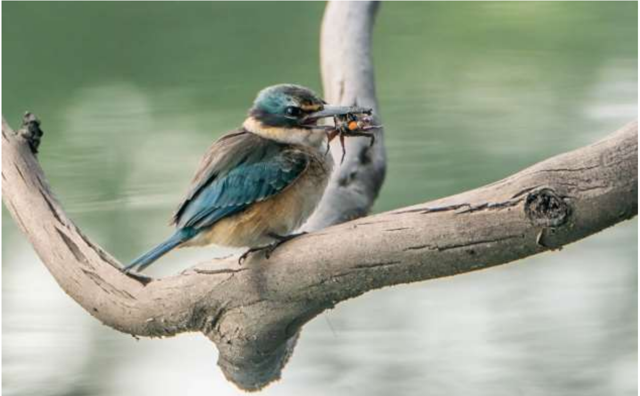
Sacred kingfisher with mudcrab