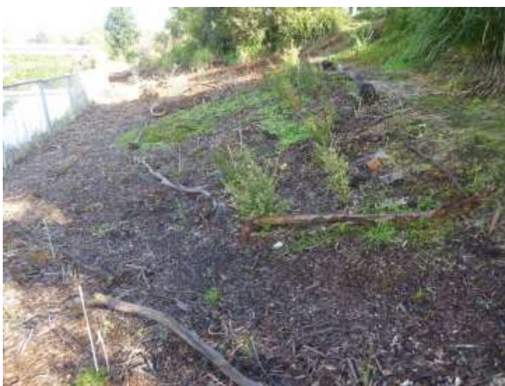
Planting on the slopes to provide mixed habitats, early 2021

In the last 12 months, despite COVID-19 lock-downs and cancellations due to bad weather, our volunteers put in about 200 hours at our regular working bees, together with a further >200 hours spent during the week by some volunteers. We collected 90 bags of weeds plus we created several very large piles of weeds (which had not gone to seed) which we hope will mulch down completely.