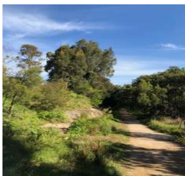
Wave rock in 2021