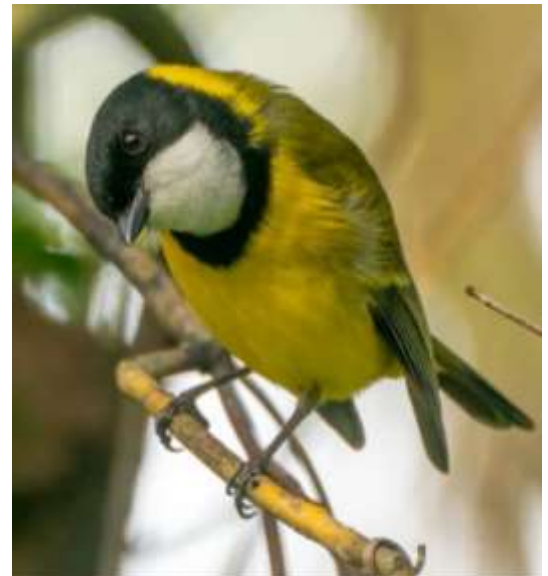
Golden Whistler, July 2021