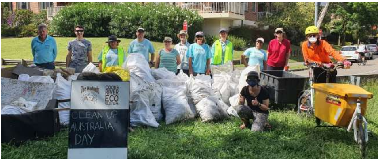
Clean Up Australia Day