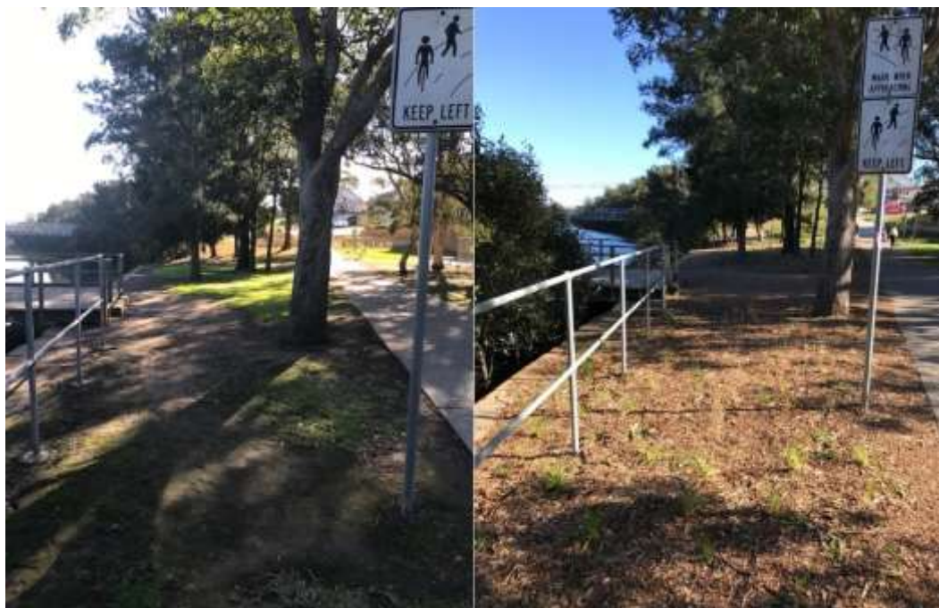
CEP Grant work: Before and after Foord Avenue/ Ewen Park