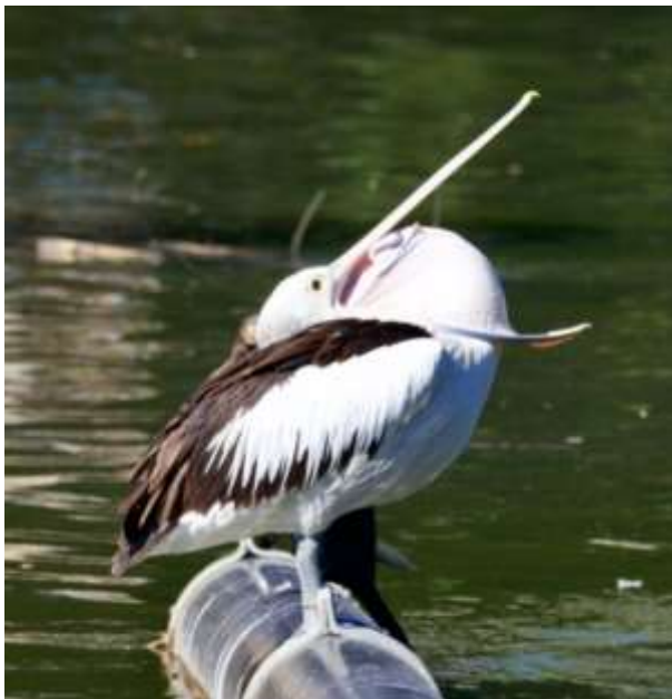
Pelican on the sugar mill boom, beak cleaning?

https://www.johaylen.com/canterbury_park_racecourse_sale_and_redevelopment_moratorium_bill_2021