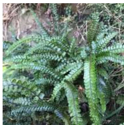
Rough maidenhar ferns