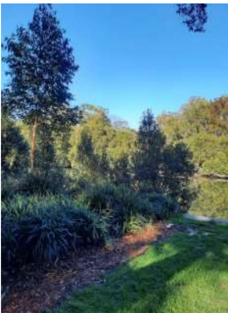
Western end of the site, July 2021