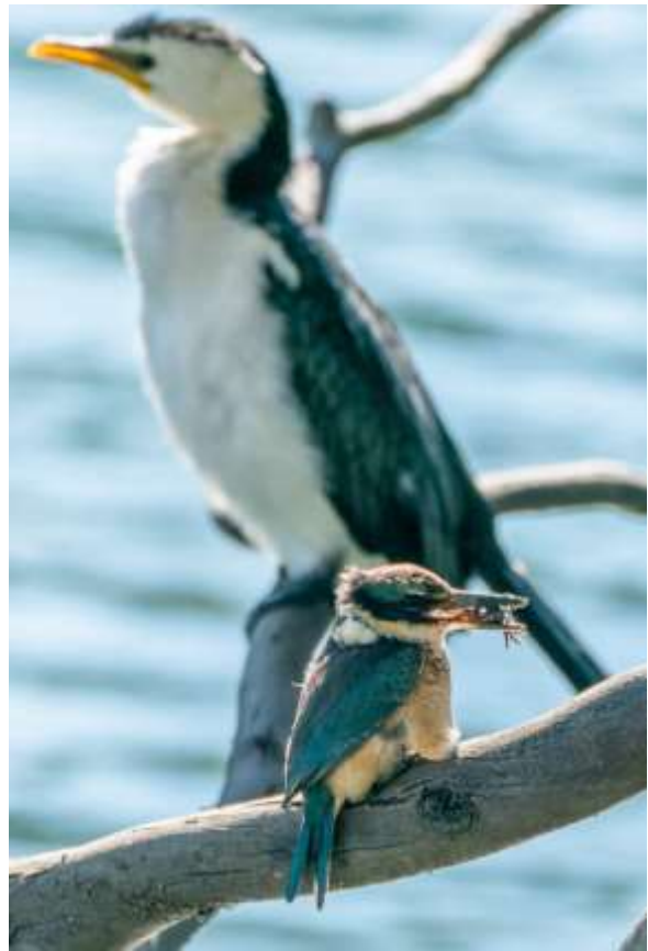
Sacred kingfisher with mudcrab, pied cormorant, July 2021

The range of bird species was consistently higher along the Boat Harbour route, reflecting the level of diverse habitat. The Cup and Saucer Wetlands has become a safe nursery for aquatic birds, with many chicks on show. On two occasions over 40 species were observed including Golden Whistlers, a Leaden Flycatcher and an Eastern Spinebill. Due to the more open vegetation along the Wave Rock route, fewer small birds were seen. The main ones seen were Welcome Swallows and Martins, although we did observe many Fig Birds. The temporary closure of Dibble Avenue Water Hole limited the scope of this survey this year. It was encouraging to consistently hear more bird song near the Wave Rock bush care site, especially the Olive-backed Oriol.