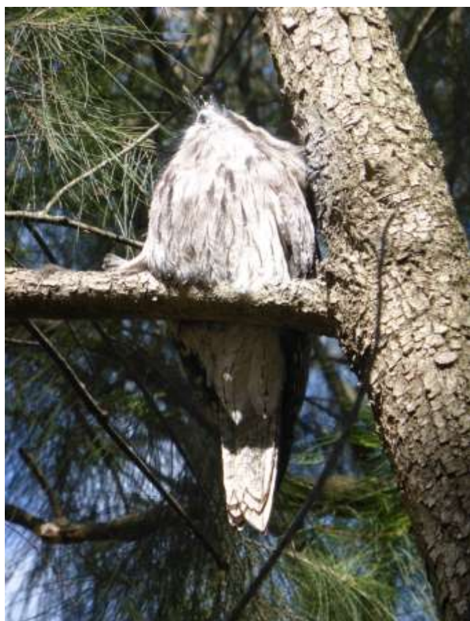
Tawny Frogmouth at Boat Harbour