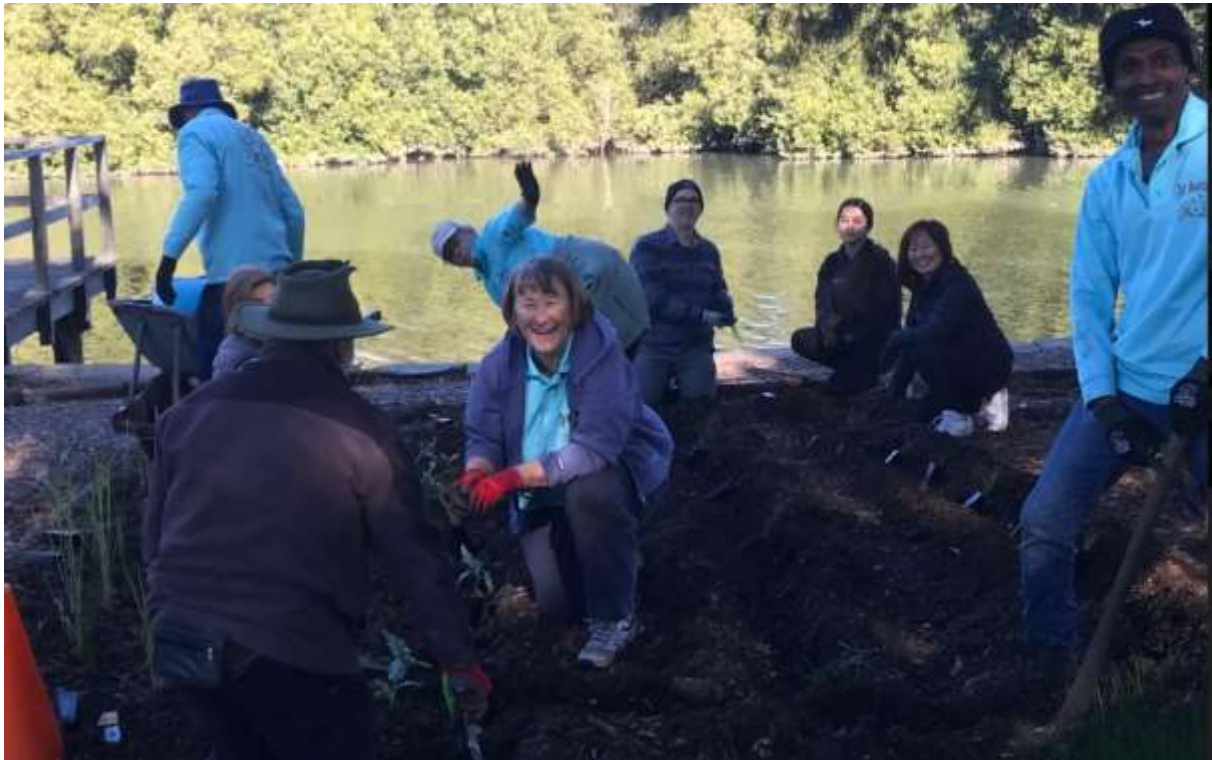
Foord Ave / Ewen Park Planting day