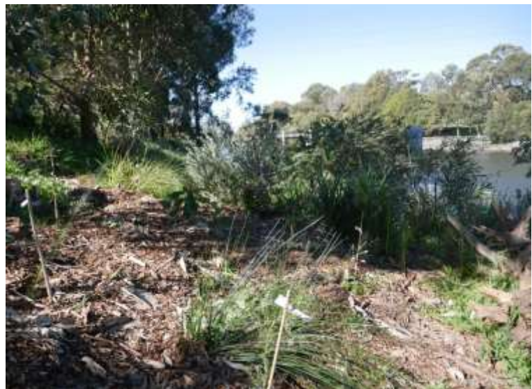
Sugar mill site, winter 2021