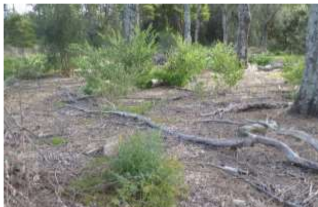
The second (middle) island