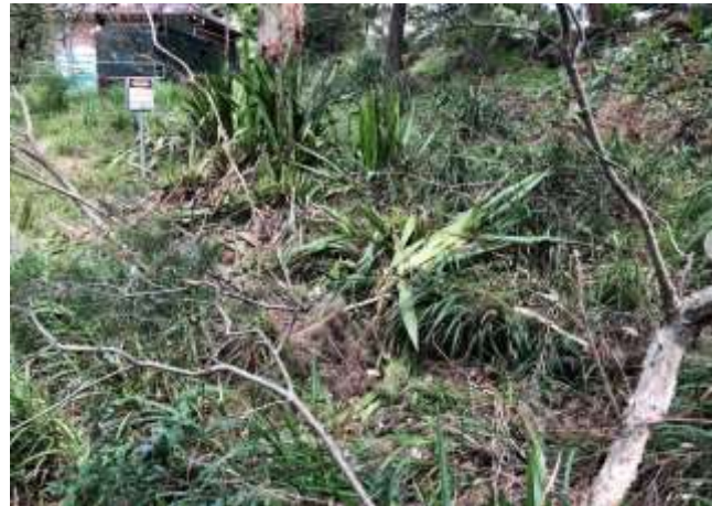
Damaged plants over pipeline

There is a High Pressure Oil Pipeline (actually three pipes – two of them actively transporting aviation fuel to and from Sydney Airport) that runs the length of the Cooks River and keen Cooks River watchers will recall that in 2016 about 1,000 trees were tagged by a pipeline contractor for assessment and potential removal as they were within the pipeline easement. The easement is eight metres either side of the pipeline so