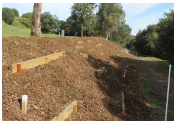
Wave rock when we began in 2013

Can I express my appreciation and thanks to the many Wave Rock volunteers for their enthusiasm, effort and dedication to caring for country over the last 8 years. Also a big thank you to the staff of Marrickville golf course and Inner West Council for their assistance and support.