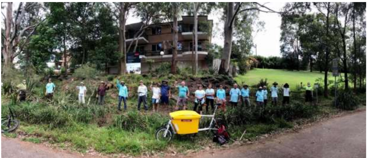
Protesting damage by pipeline contractors

During January 2021, a subcontractor employed by the oil pipeline company destroyed a lot of plants at the Boat Harbour site. The types of grasses and bushes planted along this section were not harming the buried pipeline as they have shallow roots. Our volunteers gathered in protest at the site on 7 February to let the pipeline company know that we were not happy about this. Interventions by local elected representatives, The Cooks River Valley Association, our volunteers and the general public have stopped further destruction of plants for now.