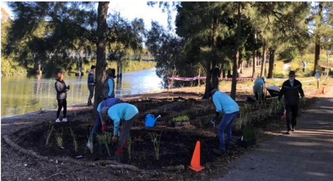
CEP Grant – Foord Ave / Ewen Park – working bee

The Inner West council grant for the production of a podcast by the Brain on Nature team is in progress, to be completed by December 2021.