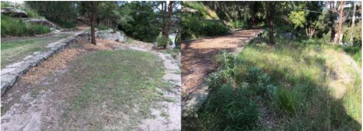
Pathway and terrace March 2020 and March 2021