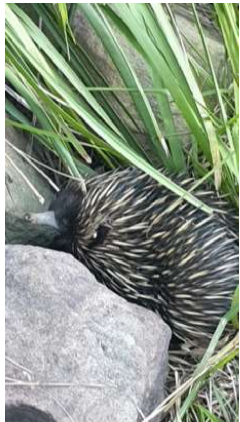
Echidna spotted at cup and saucer creek