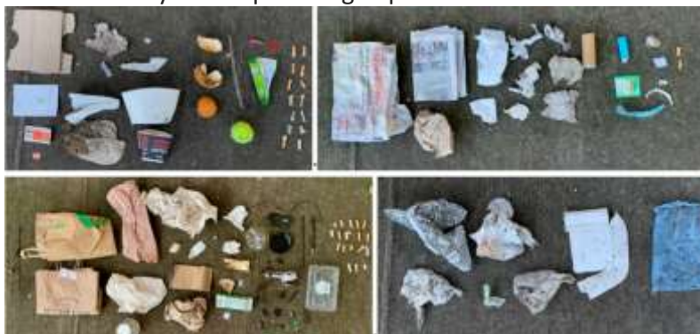
Examples of rubbish found during a trial of a seven day survey of gutters

The group also started developing a rubbish survey technique intended to map the rate of littering and identify problem areas. The goal is to develop a simple process that can be performed quickly by a large number of volunteers anywhere in the world without special equipment. In the first trial, a group of Crab Walkers measured the rubbish that built up over seven days in a selection of stormwater gutters in St Peters, Dulwich Hill, Earlswood, Marrickville and Tempe. Feedback from participants has led to the survey technique being improved and further trials are planned.